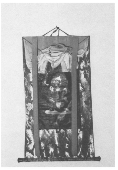
Fig. 1. Photograph of a thangka painted and mounted in traditional Khams regional style by the master painter Khams-trul Pinpoche. The dark background of the painting relates to the iconography of the subject matter.

The next step is called ser ri , or the application of gold ornamentation. Fine gold lines are painted on representations of brocade robes and cushions, and on flowers, leaves and rocks. (This stage should be distinguished from the application of flat gold areas, which is done as the last of the flat color applications.) Finally, both the flat gold areas and the gold lines are polished with a gem stone, such as onyx. After polishing of the golds, which is called ser ur , the painting is cut off the strainer and sewn onto its silk frame, or mounting. Traditionally a tailor would sew the frame.